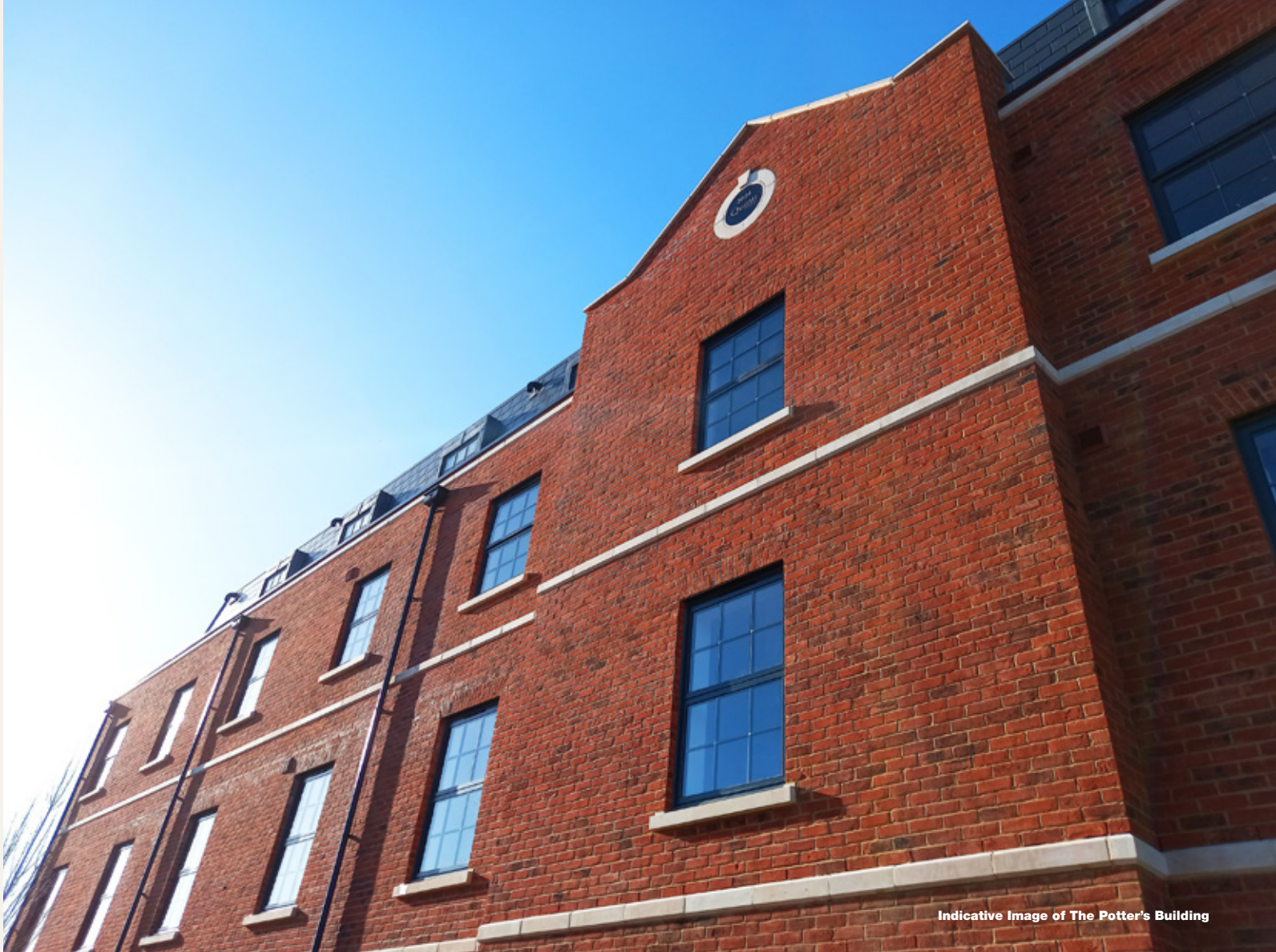
Indicative Image of The Potter's Building