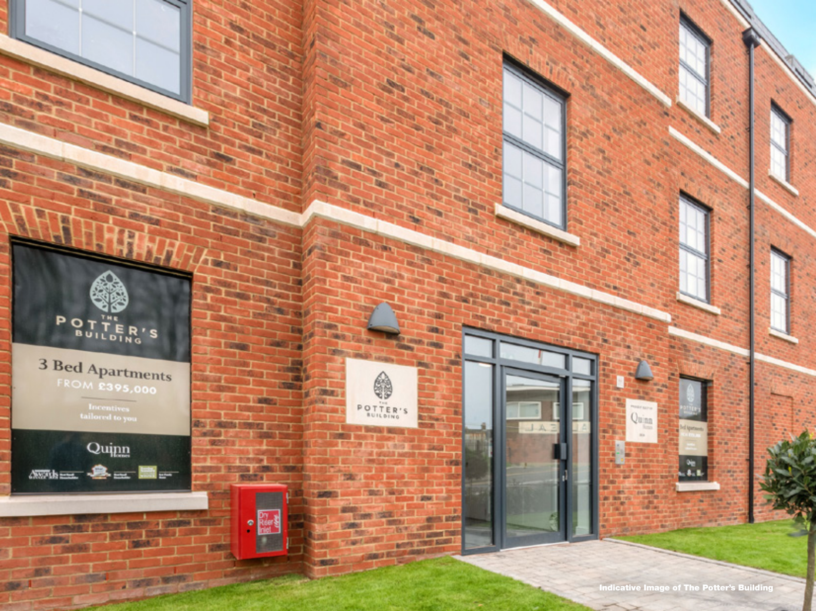
Indicative Image of The Potter's Building