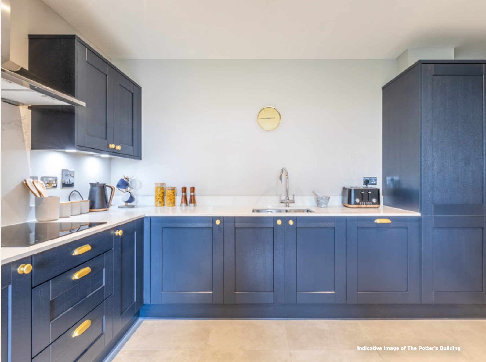
Indicative Image of The Potter's Building